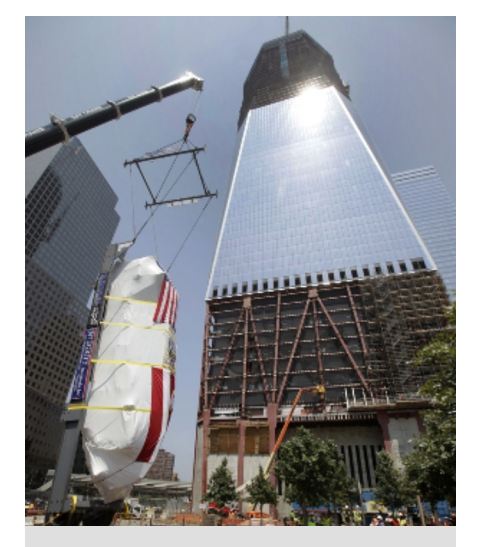
Baker team rigs Ladder Company 3 fire truck into National 9/11 Memorial & Museum

The spreader beam, also known as a spreader bar, is a popular below-thehook lifting device used to widen lifting points and stabilize and support a load during a crane lift. It consists of a long horizontal beam or bar that holds two or more slings apart and converts lifting loads into compressive forces on the bar and tensile forces on the slings. Chains or slings at the top of the beam attach to two suspension points that angle up to a single central ring. Spreader beams should not be confused with lifting beams, which have a single central attachment point at the top of the beam.